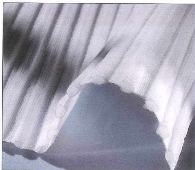
Three-dimensional nonwovens achieved by hydroentanglement at the Nonwovens Research Group, University of Leeds.

The Wassenberg-based company's fabrics are made from 100% recyclable polyester and the spacer threads – which can be anywhere between 20 and 55 mm – are elastic monofilaments that make sitting or lying on them extremely